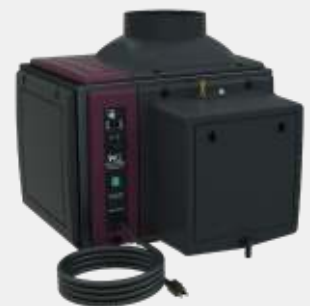
Optional Integrated Humidifier *Patent Pending

The Ducted Split system features the fan coil unit and the condensing system. Both units were designed by Wine Guardian, ensuring that they work together properly.